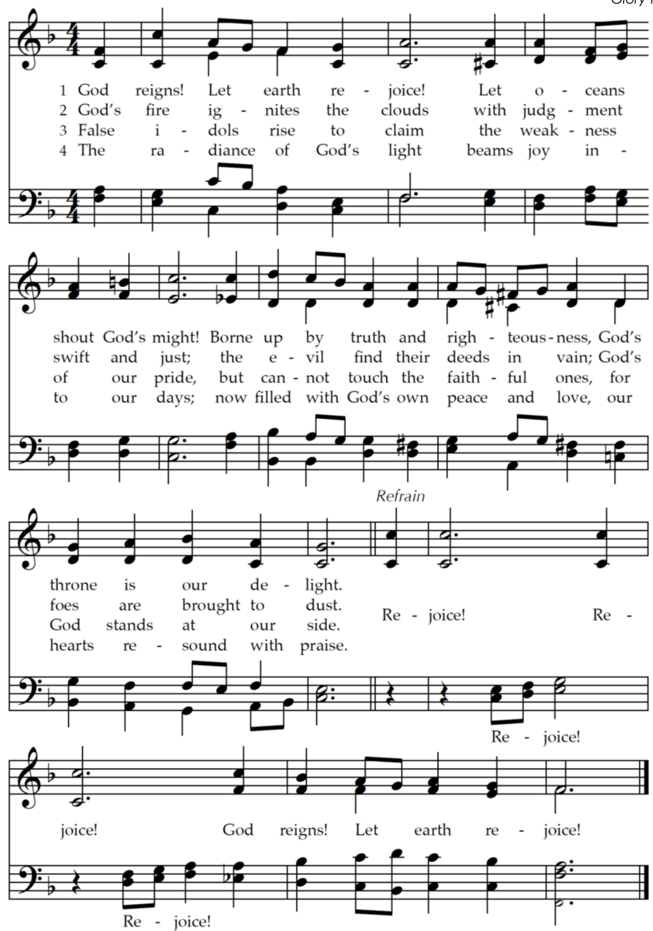
"God Reigns! Let Earth Rejoice!"