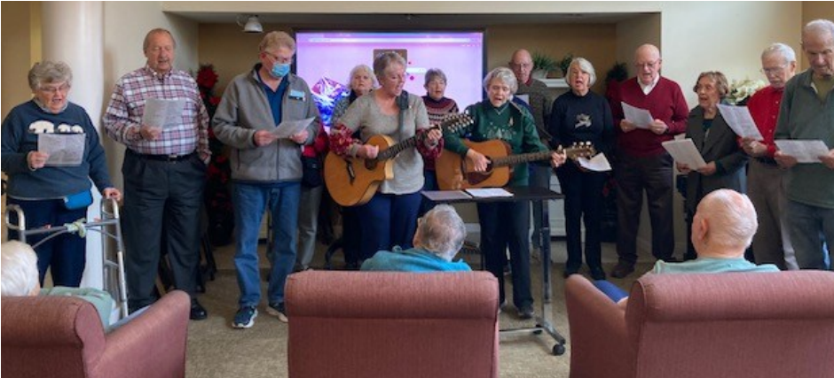
Companionship members sang Christmas carols for friends and CPC members at Aegis Carmichael in December.