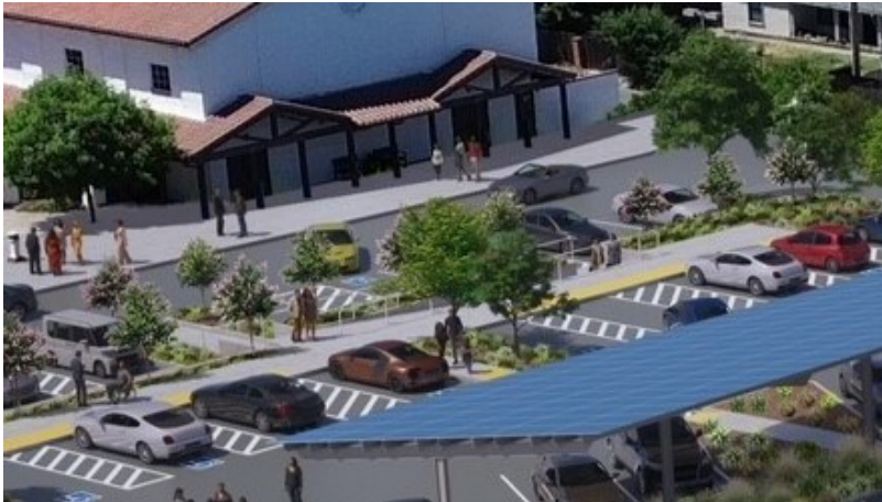
A rendering of the new parking lot project includes more accessible parking spots and a ramp from the upper parking area.

adding solar panels and an accessible ramp from the upper parking lot. This past July, Tim Farley, PLTF Chair, led a parking lot briefing for the congregation with renderings.