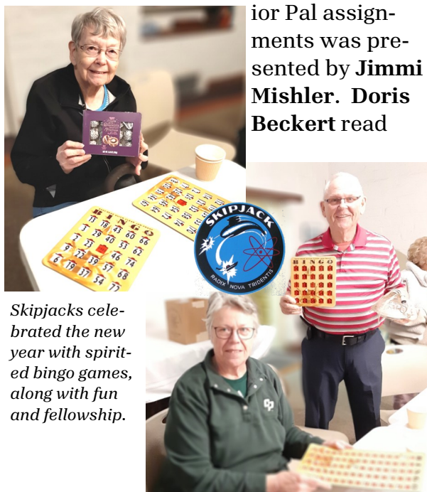
Skipjacks celebrated the new year with spirited bingo games, along with fun and fellowship.