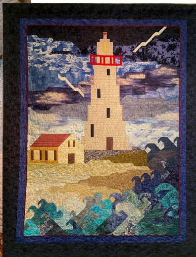
(Clockwise from top): "Resurrection," "Keep Courage During the Storm," and "Two Weeks Vacation" are on display in the DeVries Gathering Place