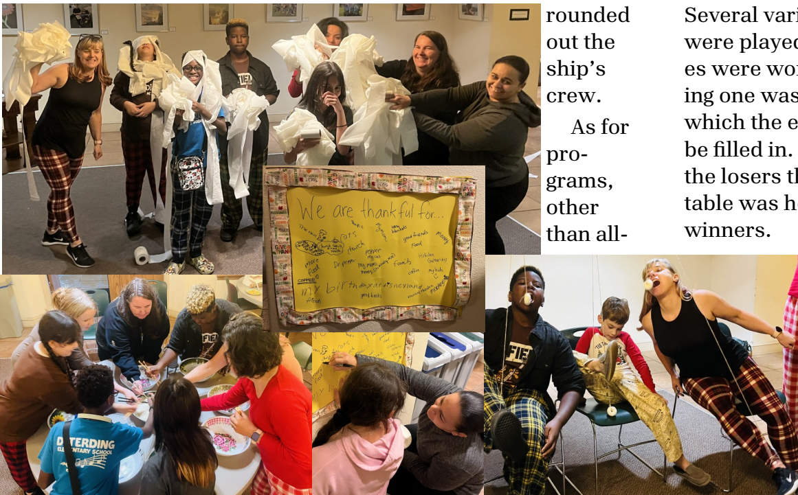
CPC's newest marinership, Mothership, launched in November with thankfulness and fun family activities. (Continued on page 14)