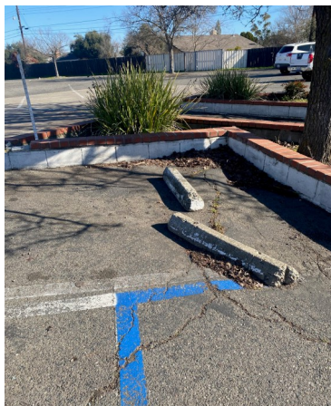
Broken barriers, faded paint, and uneven pavement are common in CPC’s parking lot.

One only needs to walk through the CPC parking lot to notice its state of disrepair. The parking lot is filled with areas of crumbling asphalt, cracks, and uneven surfaces. After a