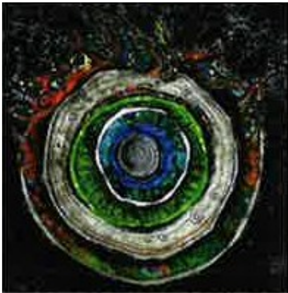
Lesson Six in the PW Horizons Study explores Climate Change.

During our study of chapters 1 through 5 in Let Justice Roll Down: God's Call to Care for Neighbors and All Creation , we reflected on Environmental Justice, Land Justice, Food Justice, Water Justice and Air Quality. We continue our discussion in February focusing on Climate Change.