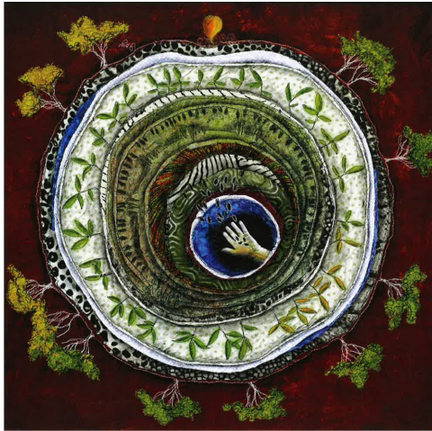
Lesson Three in the PW Horizons Study explores "Food Justice."