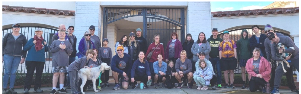
CPC's 2023 Run to Feed the Hungry group.