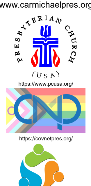
MATTHEW 25 https://www.presbyterianmission.org/ ministries/matthew-25/

5645 Marconi Avenue Carmichael, CA 95608 916-486-9081 www.carmichaelpres.org