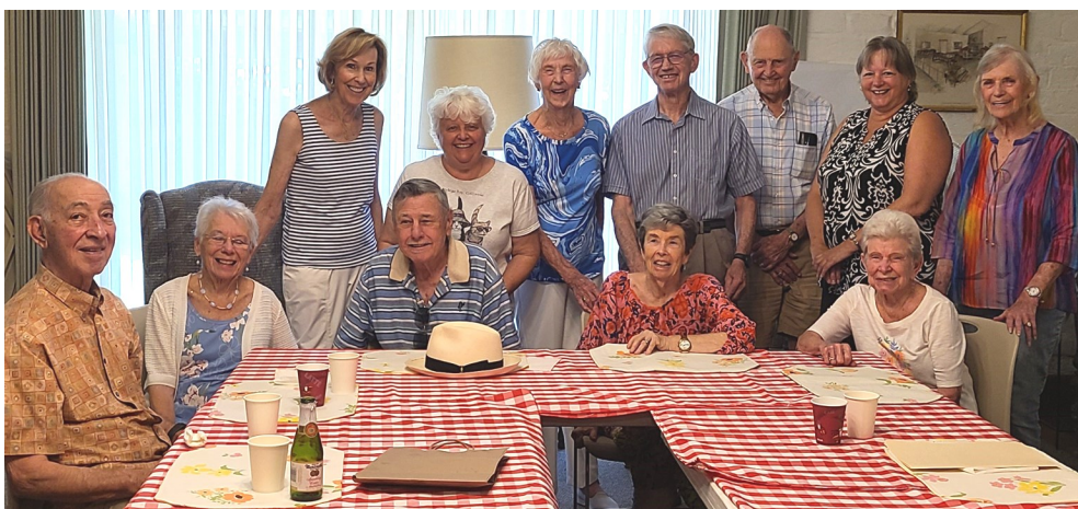
Nautilus ship members gathered in the church Parlor for food, fun, and fellowship in August.

This was not the Olympics, but (Continued on page 10)