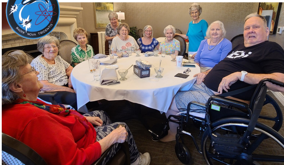
Skipjacks celebrated summer with an ice cream social and game night in August.