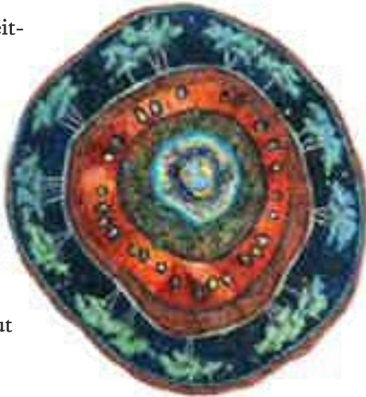
Lesson One in this year's PW Bible study focuses on environmental justice.

Ezekiel accuses some not only of pushing others aside, but also of carelessly destroying the environment. Ezekiel asserted that God will "judge between rams and goats," protecting the weak from the strong.