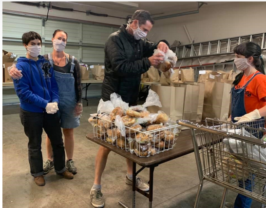
Serving through the Food Closet is just one way CPC strives to be a "Matthew 25 Congregation."

of resources for children and adults that talk about racism and justice. We are also exploring ways to begin dialogue in small groups where we can talk about how we are called to be Matthew 25 people in this place and time in our history. In addition, when we once again can be together in larger groups, we will invite people from our congregation and community to share their stories.