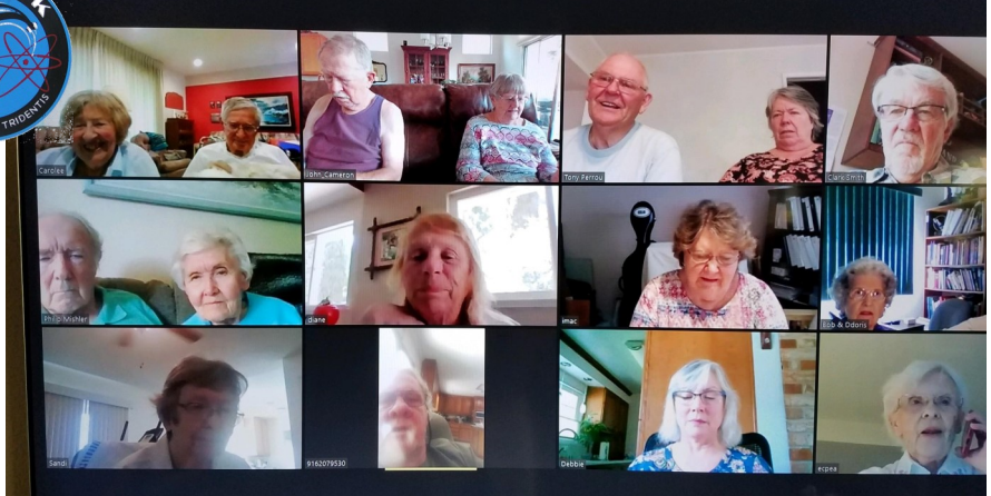
Skipjacks members have been mastering Zoom and enjoying sharing fellowship for their May and June meetings.

per meeting, what would he do and say about the reopening of our church?"